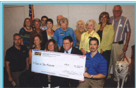
Monies collected at the Fountain Hills Realtor Marketing Session Holiday party were donated to the River of Time Museum