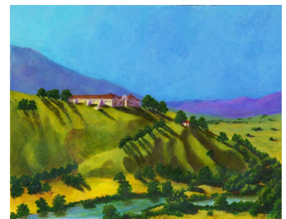
Rancho de San Francisco

The menu for this evening is Mixed Salad, Stuffed Chicken Breast, Wild Rice, Baby Carrots, Asparagus and Dessert.