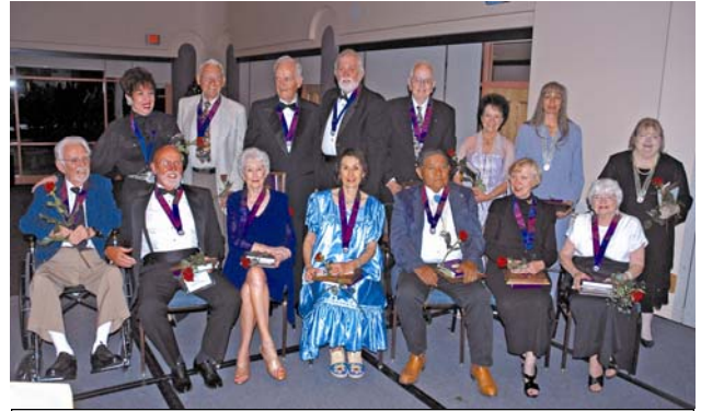
2005 Lower Verde Valley Hall of Fame Inductees